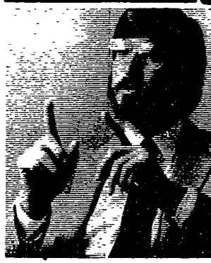
Steve Jobs invented the first personal computer in 1975 with his partner, Steve Wozniak. Today, Steve Jobs is vice chairman of Apple Computer, Inc., based in Cupertino, California. Apple Computer has grown to be the leader in personal computing.