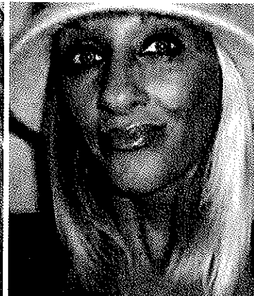
3 Weeks After Lifestyle Lift®

"Lifestyle Lift has changed my life and my self esteem has soared high since my procedure. I can't say enough good things about the staff. I want to tell the whole world about my experience"