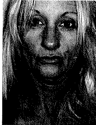
Before Lifestyle Lift®