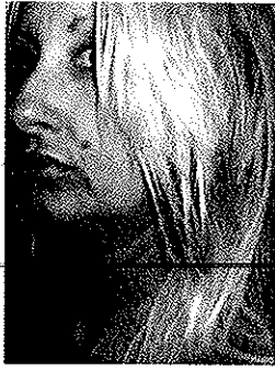
Before Lifestyle Lift®