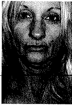
Before Lifestyle Lift®