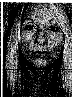
6 Days After Lifestyle Lift®