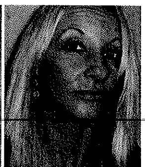
7 Days After Lifestyle Lift®