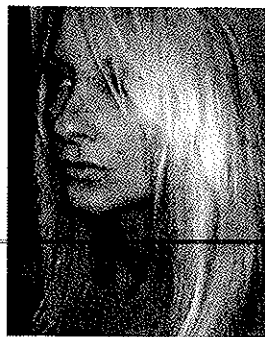
2 Days After Lifestyle Lift®