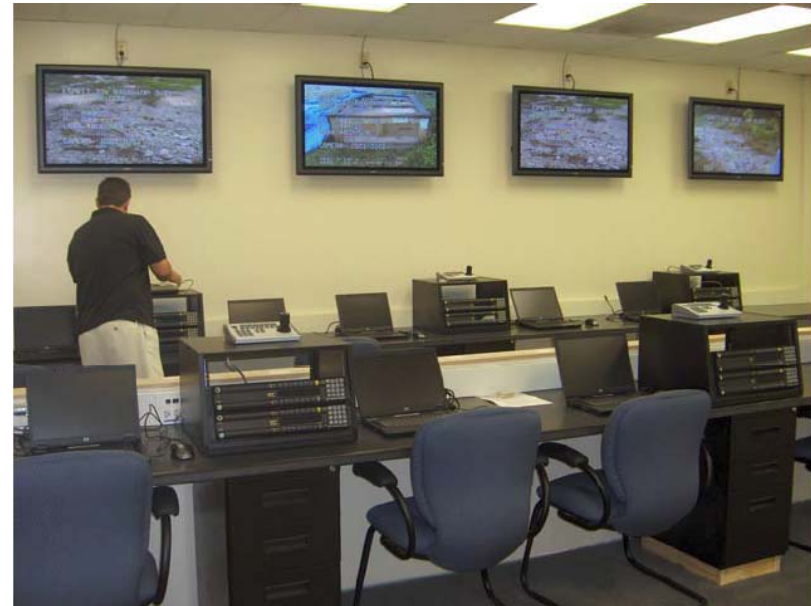
SpaceX Control Room